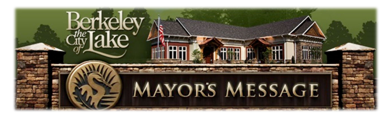
December 6, 2024