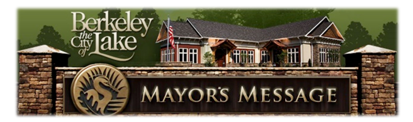
June 23, 2025